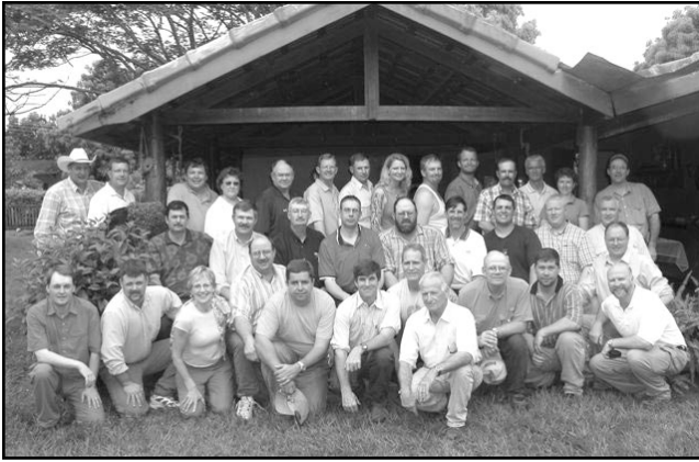
Class III at Carter Ranch in Brazil