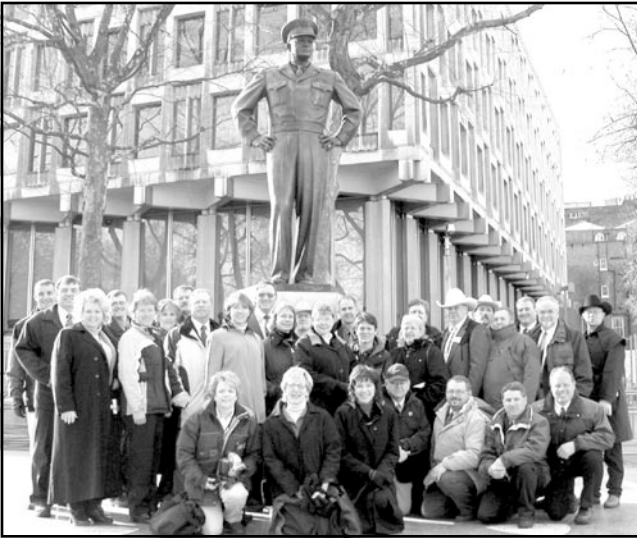
Class II at U.S. Embassy in London, England