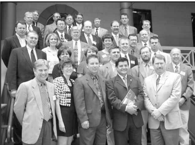
Class I at Parliament in New Wales, Australia