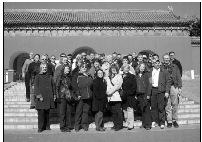
Class IV at Forbidden City, Beijing, China

The SDARL Alumni Association is privileged to have 119 dedicated individuals from the first four SDARL classes. The association meets several times a year and holds evening banquets to coincide with the current class's schedule. Annual meetings are held in January and alternate between Pierre and Rapid City. The group also offers study seminars in the United States and abroad as options for continued learning. Alumni members have proven their willingness to serve as they fill hundreds of roles within their local communities, across South Dakota, in the state legislature, and on national commodity boards.